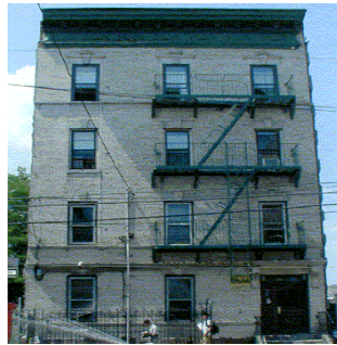
997 Summit Ave.

CATCH is a non-profit city wide housing organization that was chosen by the city and residents of 997, 1008,