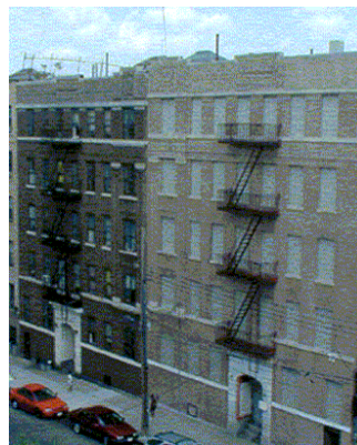
1012(L) & 1008 (R) Summit

CATCH's objective is to provide decent, safe, affordable housing and eventually resident control. In order to accomplish these objectives, CATCH will continue to work with the residents in the buildings, and have tenants meetings to keep them up-to-date and informed about plans for the buildings and the overall project.